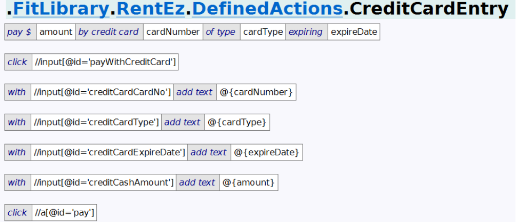
Figure 5. The resulting defined action.

When a defined action is called, the actual parameters are bound to the formal parameters and the body is executed. If the body succeeds, the call as a whole is coloured green to show success. However, if a table in the body fails, the result (with parameter bindings) is included in the report at the point of call. This provides useful diagnostic information during test execution, when it is useful to see what happens down through the layers to the implementation level.