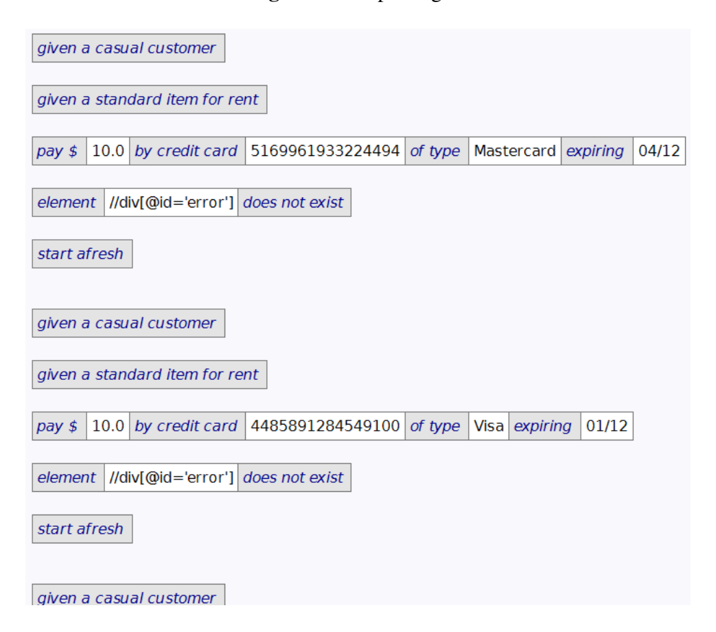
Figure 8. A multi-defined action.