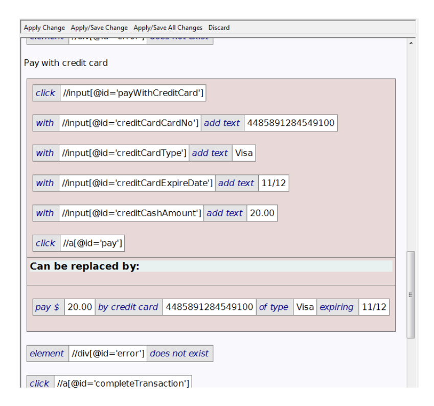
Figure 6. A potential call.